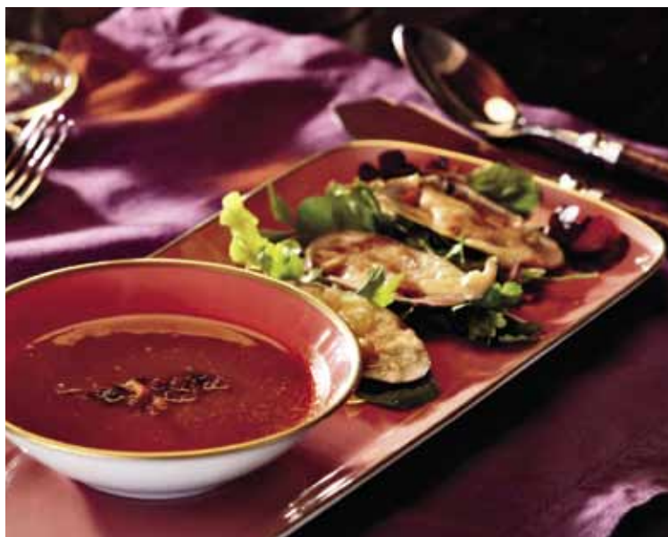
Gazpacho and Parmigiano-topped clams from Lapostolle's Clos Apalta winery

Colchagua Valley, Chile's Napa, lies immediately south of Cachapoal, but jagged shoulders of rock force an hour's drive. We emerge at the flat-bottomed, vine-covered valley floor and head for Neyen de Apalta , where Valette, the winemaker from Viña Vik, also heads production. One of Chile's oldest vineyards—a plot of gnarled Cabernet vines was planted here in 1892—Neyen sold its grapes to other producers for years. Under Valette's direction, its suave, elegant Cabernet-and-Carmenère blend ($60), first produced in 2003 and bursting with dark fruits, now retails in 28 countries.